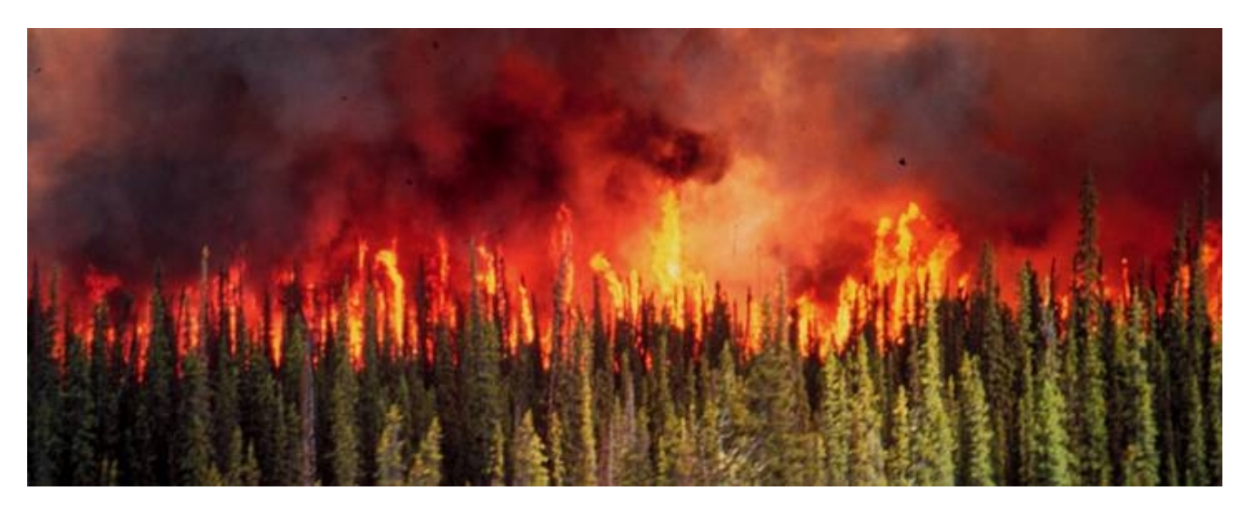
Crown Fire, Forest Service Northern Region, Missoula, MT

At the same time, the congressman acknowledged the local versus national tension in federal land management and urged federal land managers to pay closer attention to the needs of local communities, which are often expressed through their county commissioners. (See discussion below).