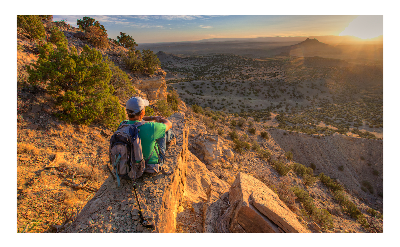
Andrus Center for Public Policy