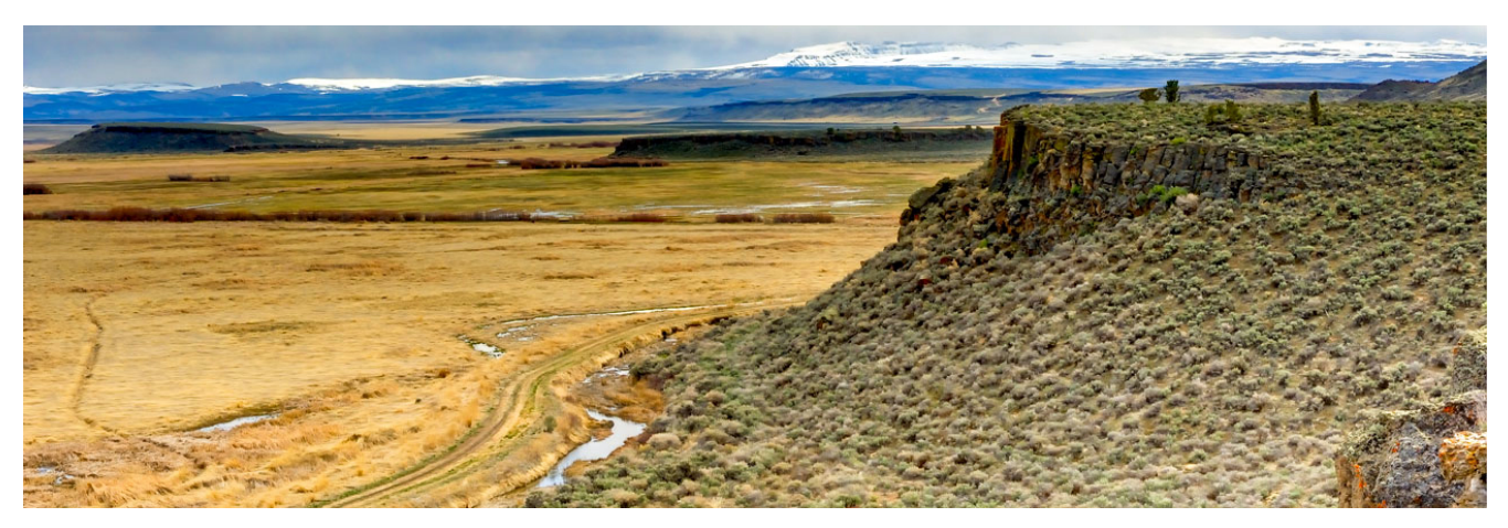
Buena Vista Overlook, Malheur National Wildlife Refuge